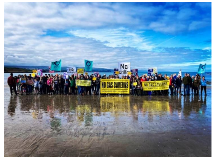
Campaigners supporting the 'No Gas Caverns' legal challenge at Browns Bay Beach, Islandmagee, County Antrim in January 2024.

Committee for consideration; and second, that the first instance Judge had erred in his factual conclusion that the Community Fund was not considered by the Minister. The appeal was heard by the Court of Appeal (NI) and Lady Chief Justice Keegan delivered the judgment of the Court on 17 June 2024. The appeal succeeded on both grounds and the licences were quashed. In July 2024 the Minister for DEARA announced that it would be appealing the judgment to the UK Supreme Court, with the justification that it has implications for ministerial decision-making in the context of climate change and the definition of matters which are cross-cutting, significant and controversial and which therefore require referral to Northern Ireland's Executive Committee. It is yet to be confirmed that the case meets the strict admissibility criteria of the Supreme Court.