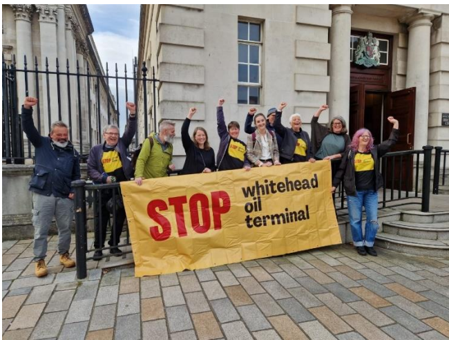
Campaigners from 'Stop Whitehead Oil Terminal' celebrate as they leave Belfast High Court in September 2024.

On the 9 September, the applicants were fully vindicated with an order made by consent by the High Court quashing the approval to expand the oil terminal. The separate challenge against the Department for failing to call-in the expansion project under the powers of the Planning Act (Northern Ireland) 2011 was adjourned generally.