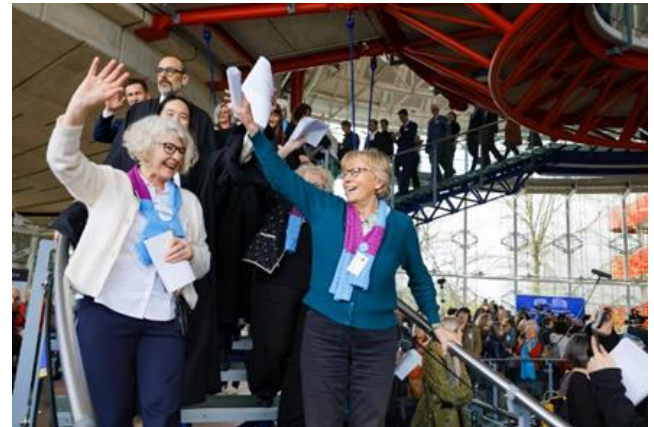
Climate activists from Switzerland celebrate as they leave the European Court of Human Rights (ECHR).

This case involved a judicial review challenge to the grant of planning permission for the extraction of oil at Horse Hill, Surrey. The environmental impact assessment (EIA), required as part of the planning permission, did not